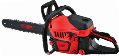
KL 5810 PRIME

Displacement Rated Power Cutting Capacity Total Weight 58CC 2.6kw / 3.54hp 22" 6.8kg