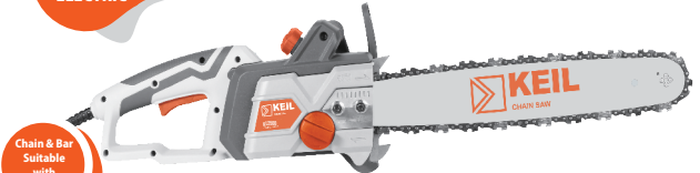
KL 2500 ELECTRIC

Power Motor Voltage Saw Chain Speed Bar Length Total Weight 2000 W Copper 220 V 480 M/Min. 16" + 18" 5.2kg