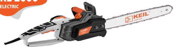
KL 2000 ELECTRIC

Power Motor Voltage Saw Chain Speed Bar Length Total Weight 2000 W Copper 220 V 480 M/Min. 16" + 18" 5.2kg