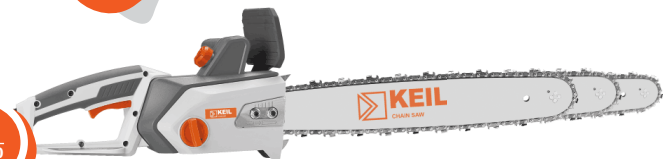
KL 3000 ELECTRIC

Power Motor Voltage Saw Chain Speed Bar Length 2500 W Copper 220 V 800 M/Min. 22"