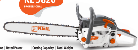
KL 5820 PROFESSIONAL