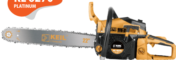
KL 6270 PLATINUM

Displacement Rated Power Cutting Capacity Total Weight 62CC 2.9kw / 3.9hp 22" 7.0kg