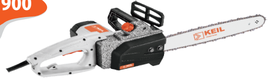
KL 1900 ELECTRIC

Power Motor Voltage Saw Chain Speed Bar Length Total Weight 1900 W Copper 220 V 480 M/Min. 16" 5.0kg