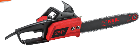
KL 1600 ELECTRIC

Power Motor Voltage Saw Chain Speed Bar Length Total Weight 1600 W Copper 220 V 480 M/Min. 16" 4.2kg